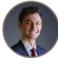
Jon Ossoff, Candidate for U.S. Senate

As Senator, Rev. Warnock will continue to advance these progressive values, as well as fight to improve our education system by investing in teachers and schools, ensure every vote counts by expanding voter protections, and make strides to end mass incarceration and give people a second chance. Rev. Warnock believes ordinary people should have a path to prosperity in America, and as Senator, he is committed to creating strong public policies to create those opportunities.