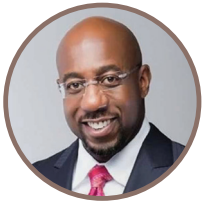
Rev. Raphael Warnock, Candidate for U.S. Senate

Rev. Warnock is a senior pastor preceding over the same church where Dr. Martin Luther King Jr. preached. As a pastor, he has long advocated for quality, affordable health care coverage and to ensure hardworking Georgians can make a living wage.